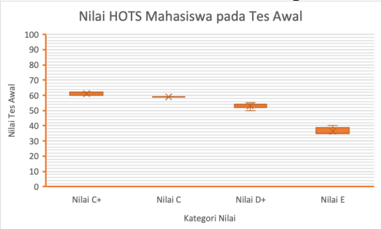
Figure 4. Student HOTS scores on the initial test

The average HOTS score of students at the time of the initial test was 55 which was included in the D+ value category. There were 11 students who received C+ grades, 3 C grades, 9 D+ grades, and 4 E grades. The student HOTS scores generated in the pre-test administration are shown in Figure 4.