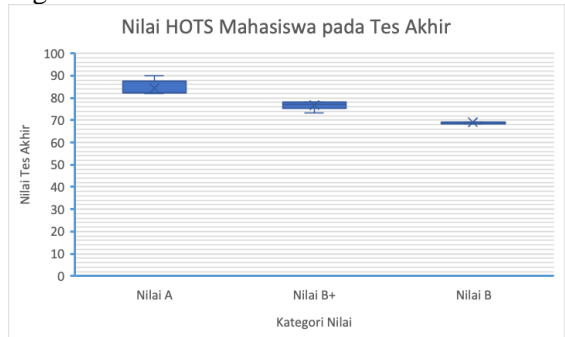
Figure 5. Student HOTS scores on the final test

student HOTS scores generated in the administration of the final test are shown in Figure 5.