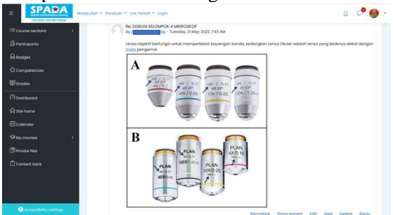
Figure 3. Group discussion process

The form of responses or answers from representatives of the presenting group (who have PPT products) can be in the form of material descriptions, illustrated pictures, even video simulations to make it easier for students to understand concepts. The discussion process for each topic can be seen in Figure 3.